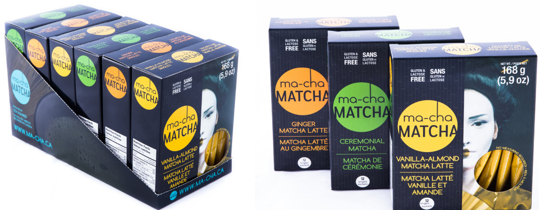
Ginger, Vanilla-Almond, Ceremonial Matcha