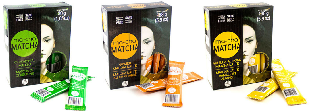
Ceremonial Matcha, Ginger, Vanilla-Almond