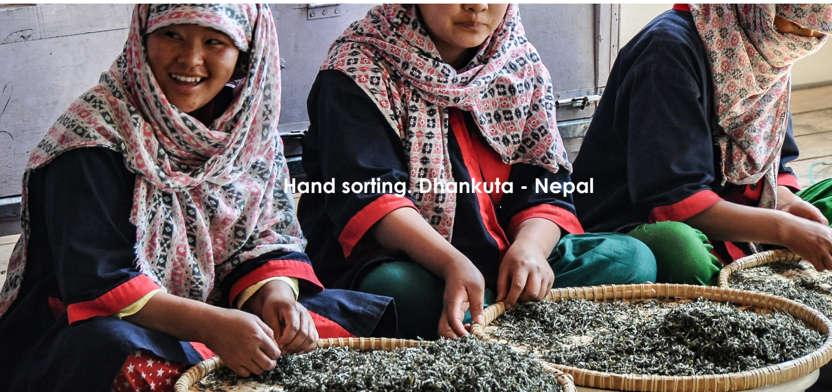
Hand sorting. Dhankuta - Nepal