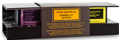
Sleep & Relax