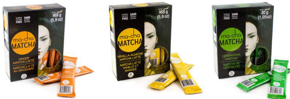
Ginger, Vanilla-Almond, Ceremonial Matcha