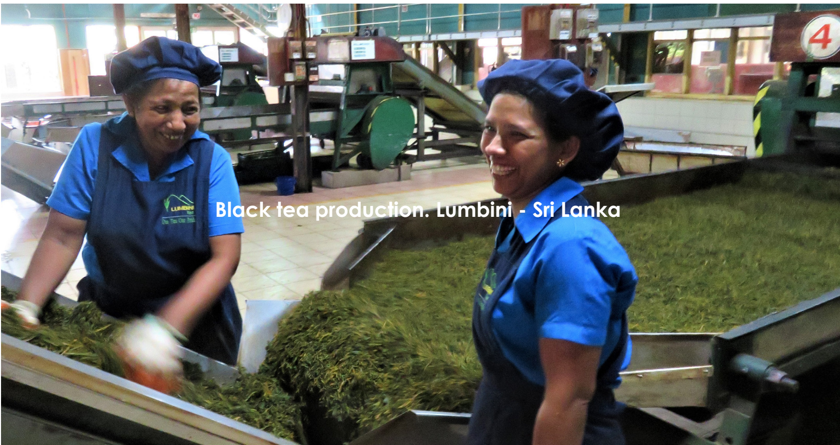
Black tea production. Lumbini - Sri Lanka

Ingredients: Black tea, cardamom, cinnamon, black peppercorns, nutmeg