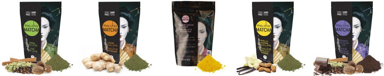
Green Chai Latte, Ginger Matcha Latte, Vanilla –Almond Matcha Latte, Decadent Chocolate Chai, Turmeric Matcha Latte