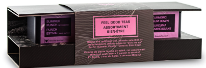
Feel Good Teas